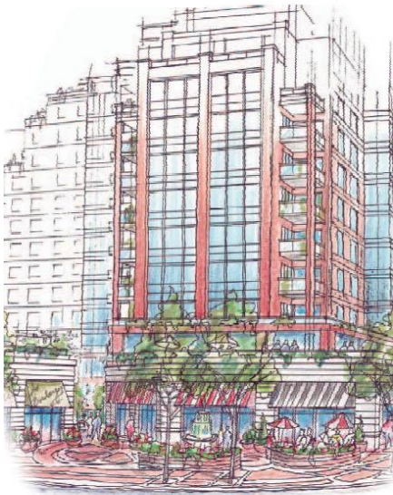
Centuria. Urban Village.