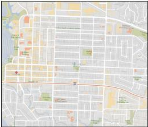
Property highlighted in blue