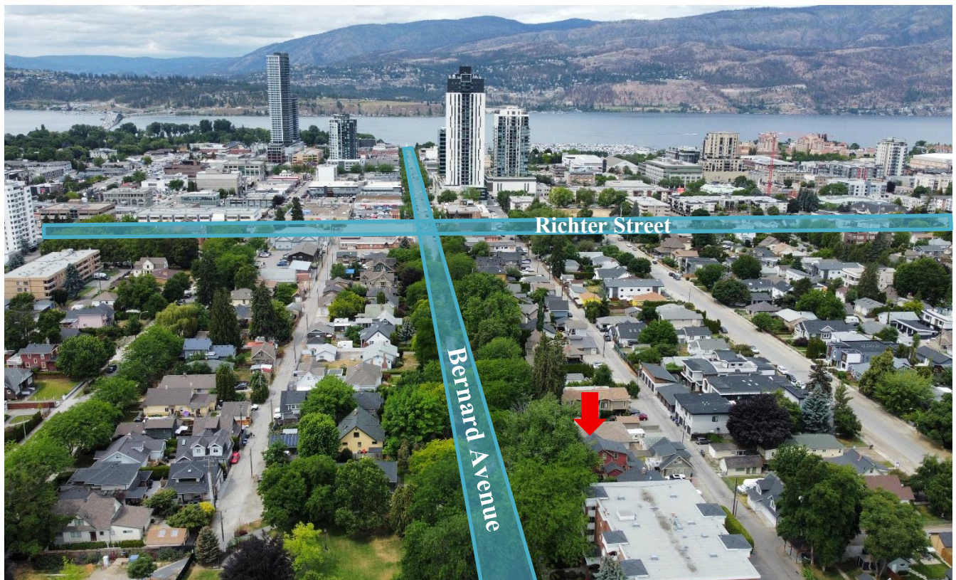
AERIAL VIEW FROM EAST PERSPECTIVE