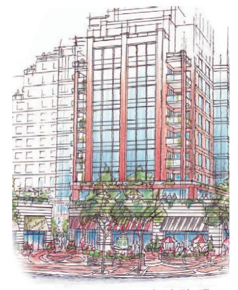
Centuria, Urban Villa