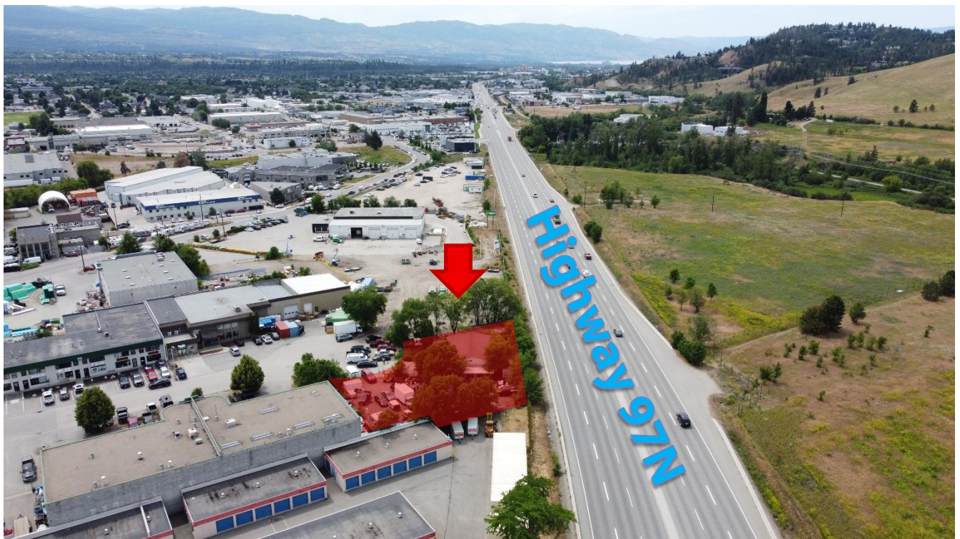
AERIAL VIEW FROM NORTH-EAST PERSPECTIVE