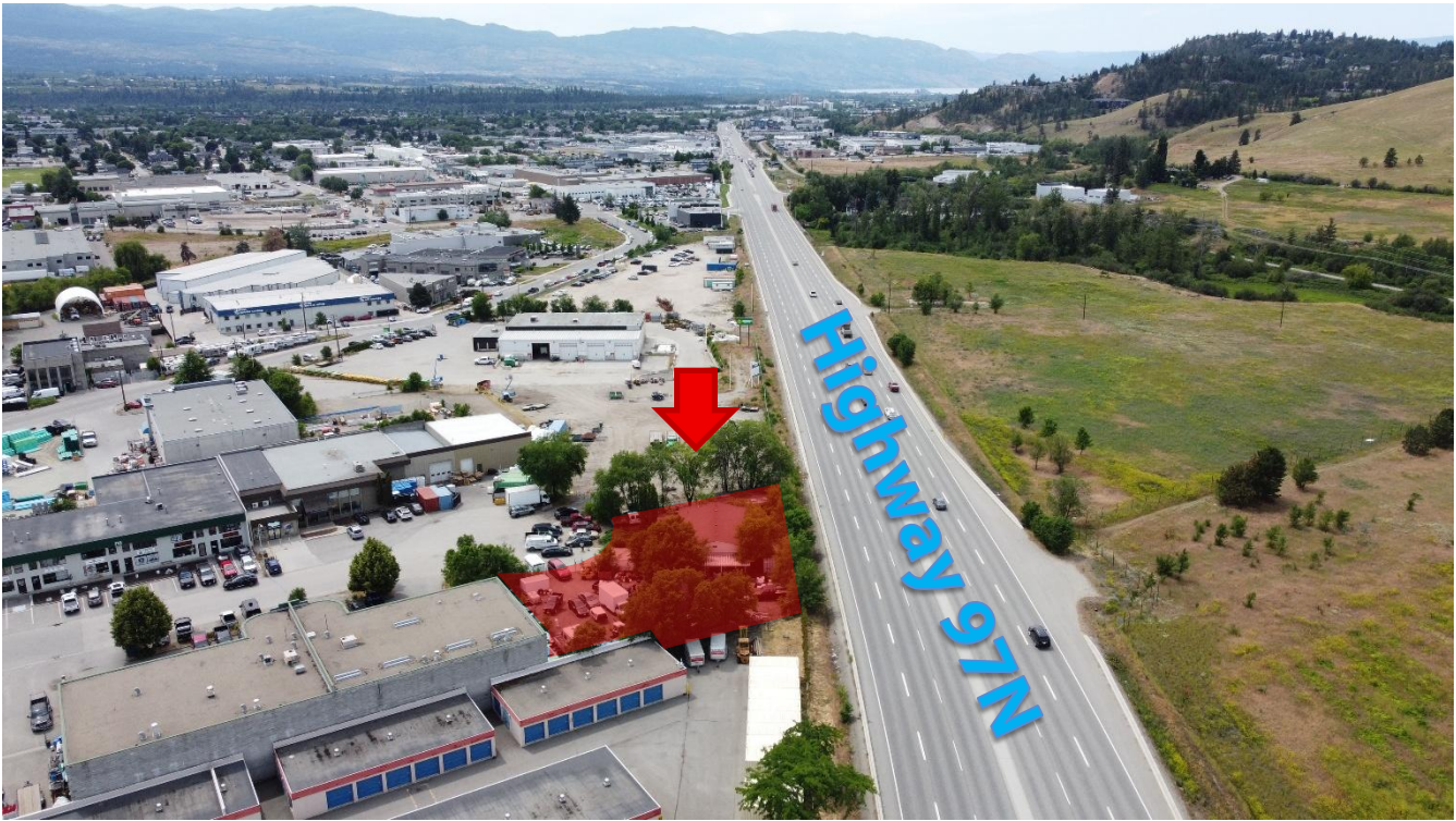
AERIAL VIEW FROM NORTH-EAST PERSPECTIVE