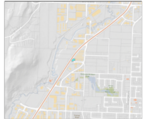
Property highlighted in blue